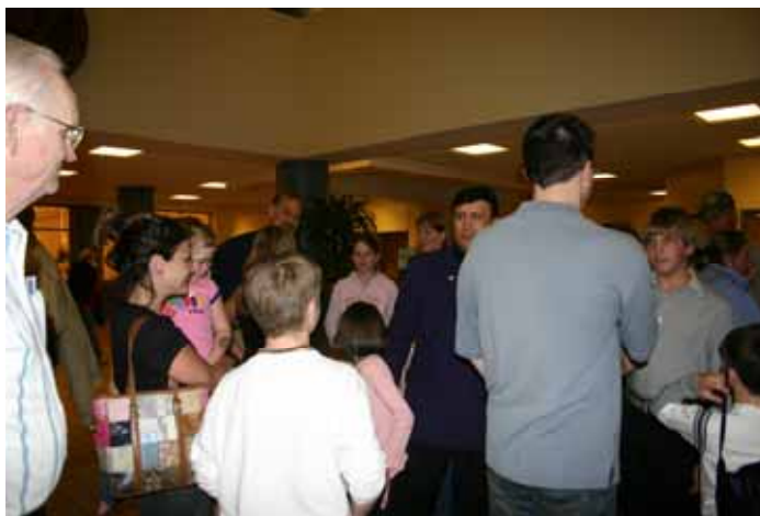
Performers greeting the audience after the show.

mixes comedy and well as some awesome sleight of