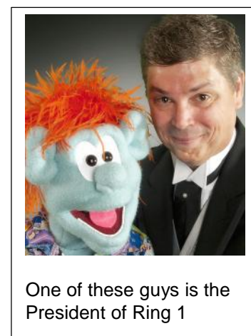
One of these guys is the President of Ring 1